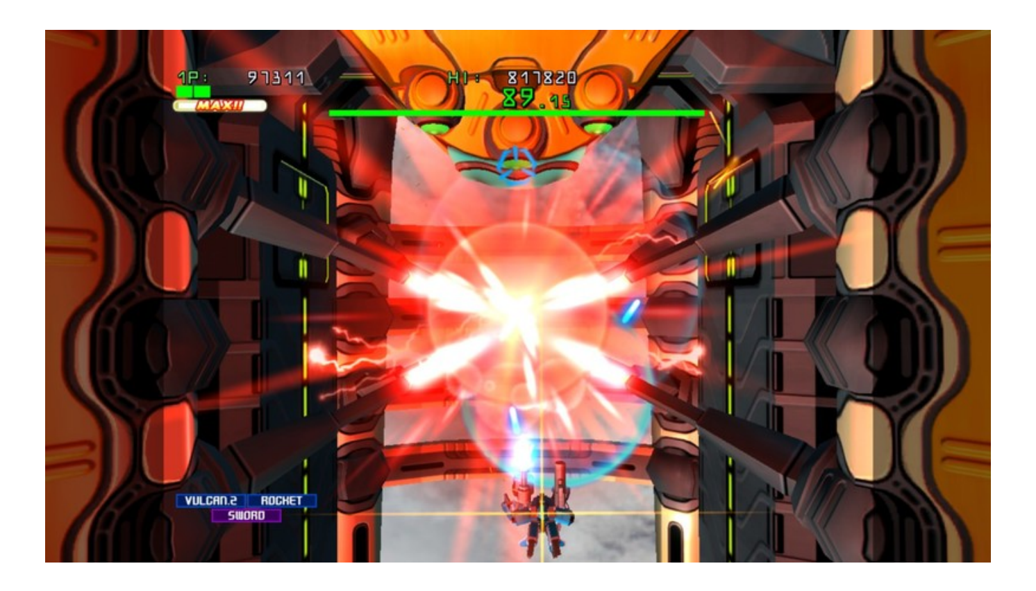
Strania - The Stella Machina - Offline Activation Keygen